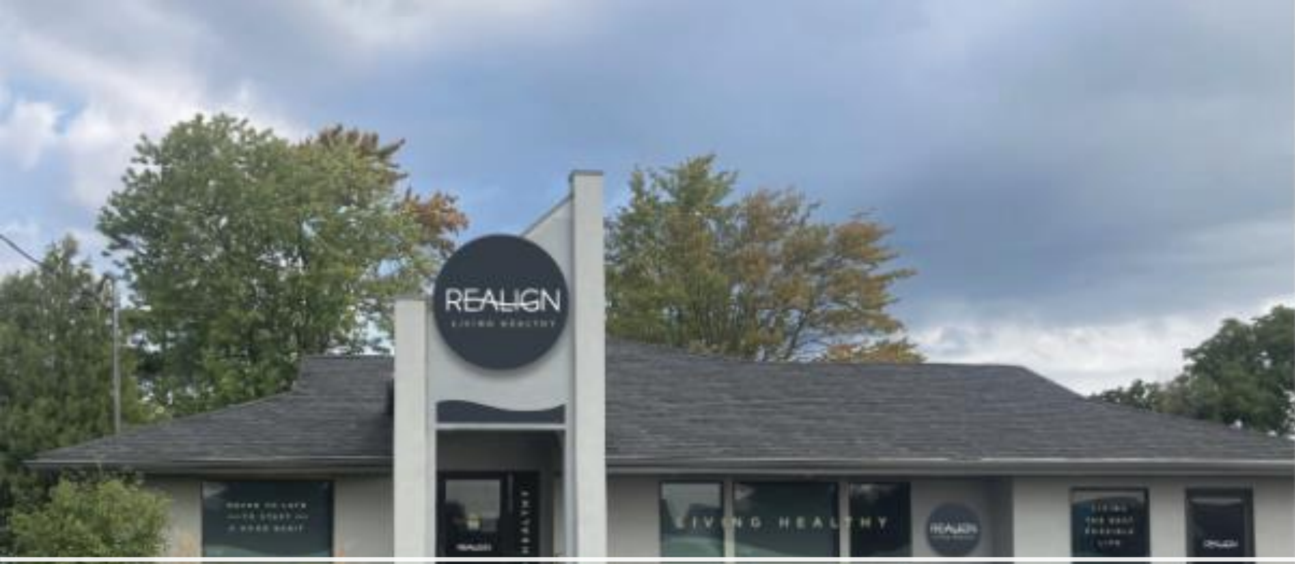
2040 Eagle Street N Development Proposal