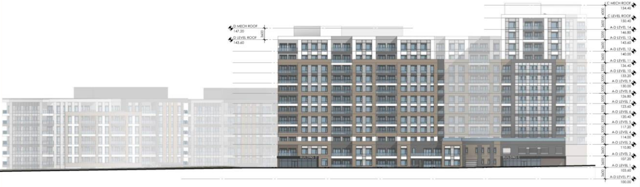
ELEVATIONS 1:500 EAST ELEVATION 2023.06.09