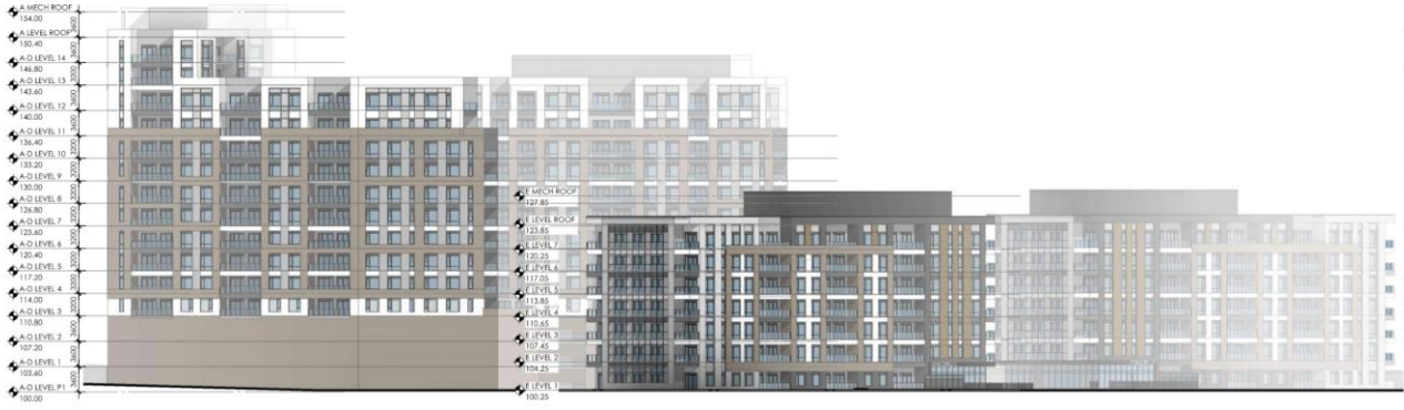
ELEVATIONS 1:500 WEST ELEVATION 2023.06.09