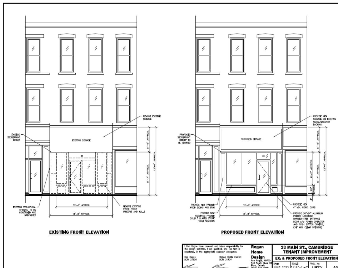
Figure 2: Existing and Proposed Front Elevation Drawings, 33 Main Street

Figure 2 is from the drawings submitted to satisfy the issuance of both a heritage permit and a building permit for the proposed alterations.