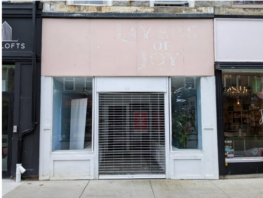
Figure 1: 33 Main Street, Cambridge (Google Streetview)

The front door will also be replaced with a steel door that will be automatic to provide barrier free access and bring it up to code under the Ontario Building Code. There are minimal interior renovations proposed. The interior renovations proposed do not require review by Council and are, therefore, exempt from this report.