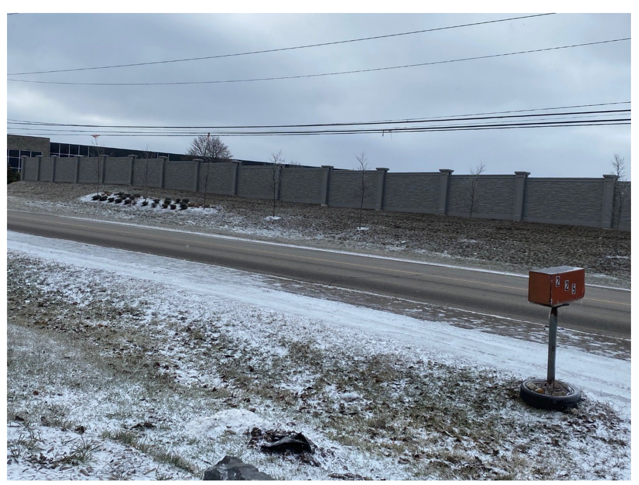
Current View across from 225 and 221 Royal Oak Road