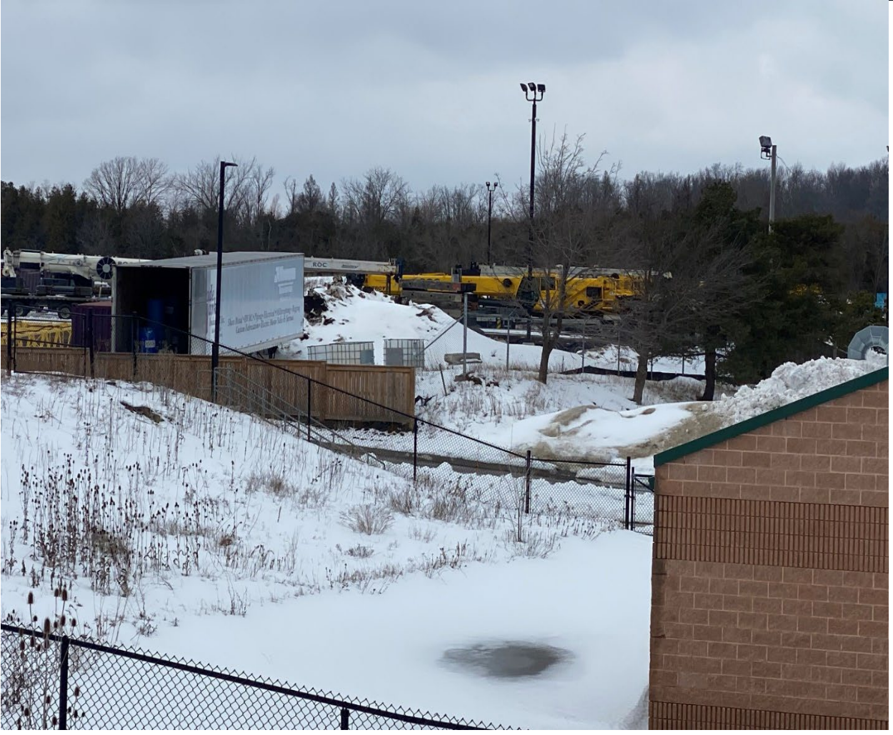
Picture taken March 1, 2023 of the type of construction equipment and trucks that Trademark currently has and runs daily not to mention about 300 staff cars and the company pickup trucks