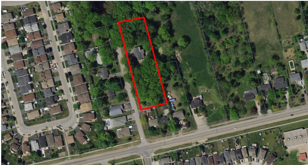
Figure 1: Aerial View of the Subject Lands

The subject lands are shown in Figure 1.