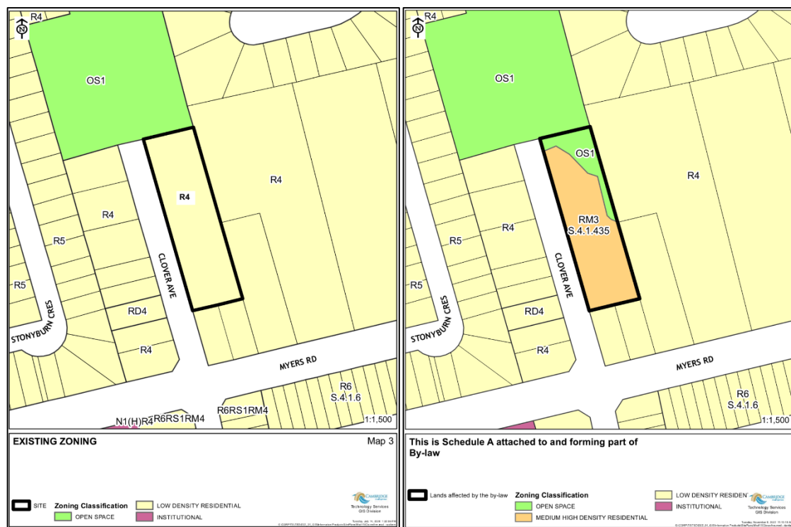
Figure 4: Existing and Proposed Zoning for the subject lands

The existing and proposed zoning is shown on Figure 4 below.