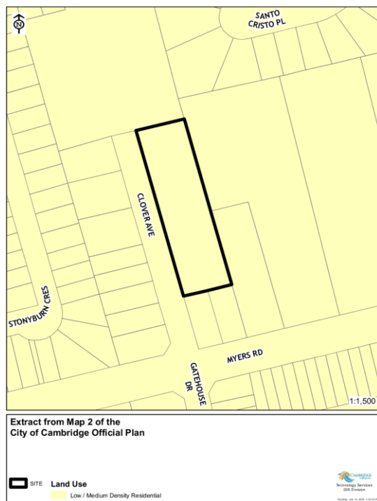
Figure 3: Existing Map of the Official Plan

The existing land use designation in the City's Official Plan is shown on Figure 3.