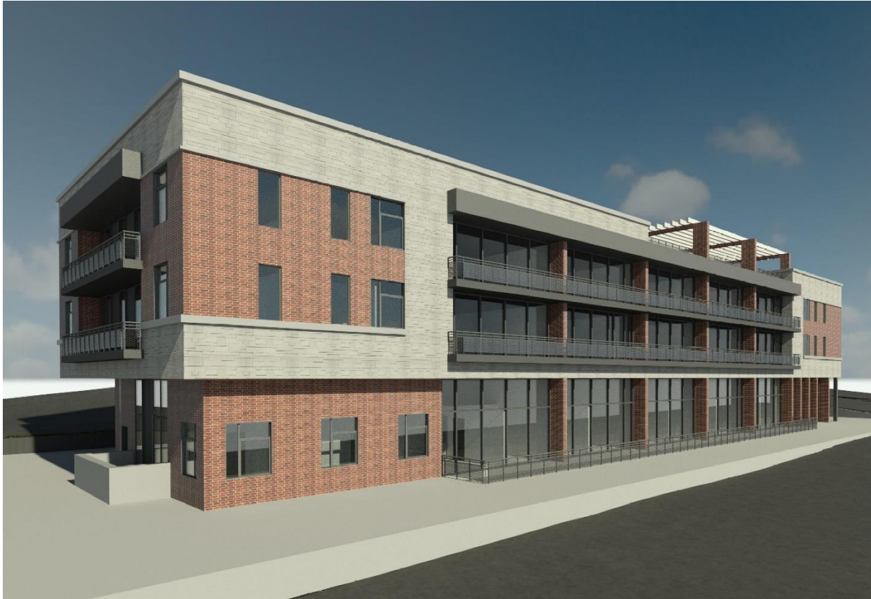
Figure 3: Rendering of the Proposed Development