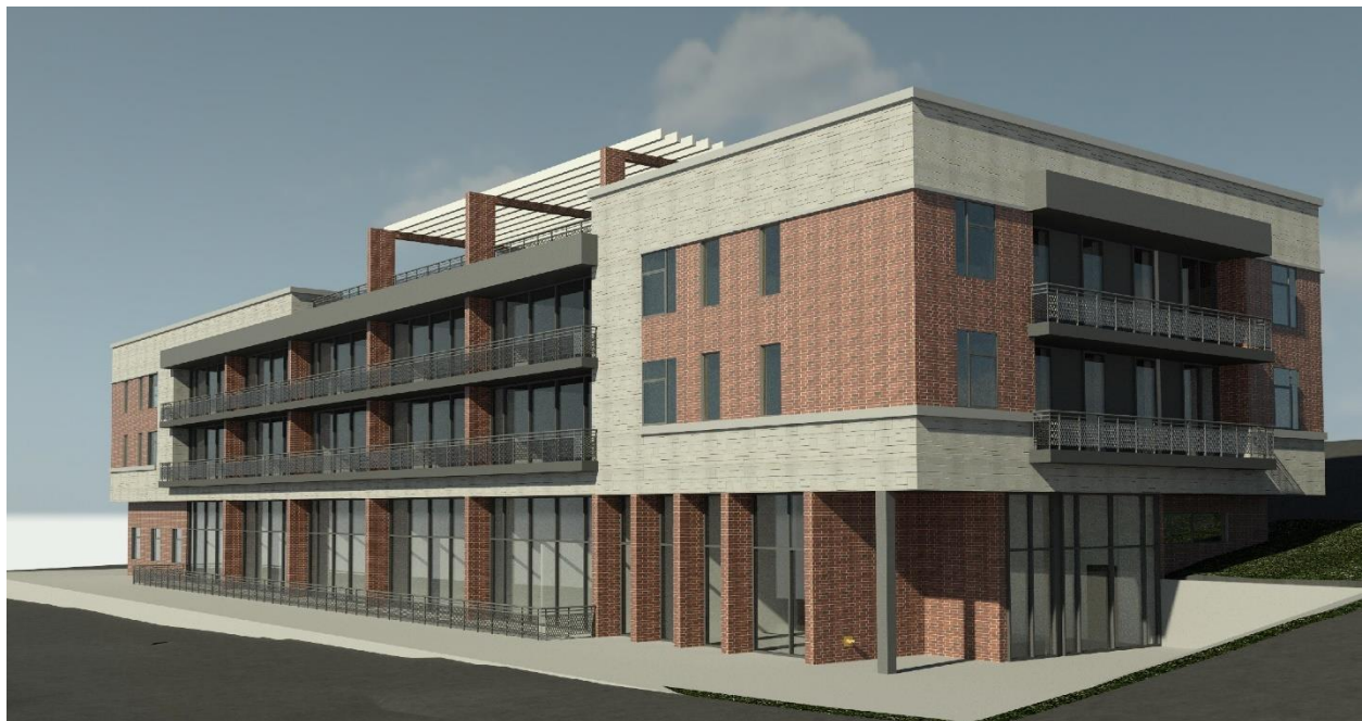
Figure 2: Rendering of the Proposed Development

Figure 2 and 3 below provides renderings illustrating the proposed apartment building: