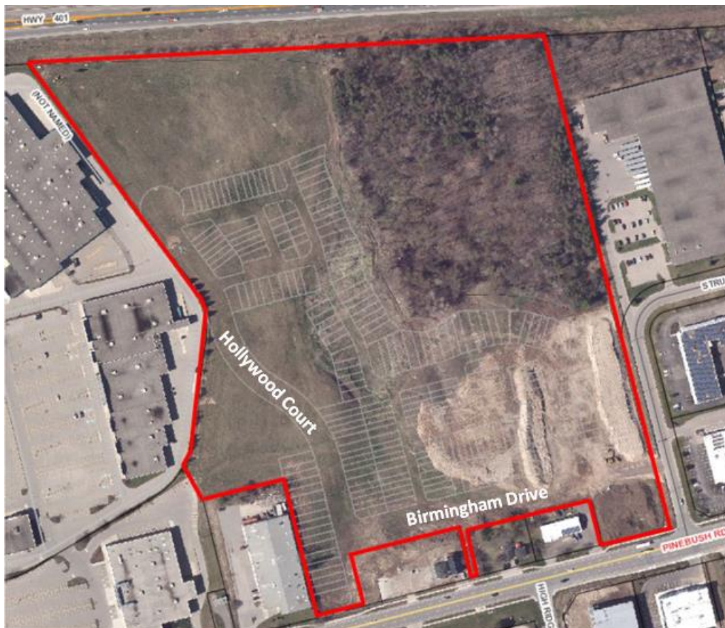
Figure 1 – Property Location Map

The property was previously municipally addressed as 108 Pinebush Road. The entire property is one subdivision that was registered on March 22, 2021 (58M-669). Since the approval of the subdivision and the construction of roads new addressing has occurred throughout the property. The Blocks subject to this application now contain addressing off of Hollywood Court and Birmingham Drive.