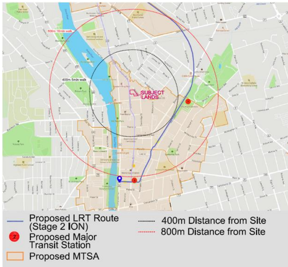
Figure 4 – Major Transit Station Area Mapping Showing Location of Subject Property

The subject lands are located within a Major Transit Station Area (MTSA) that was endorsed by Regional Council in June 2019. The lands are in close proximity to the Region's Proposed Phase 2 ION Light Rail Transit (LRT) system and specifically within the Council endorsed proposed Major Transit Station Area. Transit stations are proposed adjacent to Galt Arena Gardens and further south at the terminus of the Cambridge LRT line on Bruce Street at Water Street. The subject lands are an approximate five (5) minute walk to the proposed transit stop adjacent to Galt Arena Gardens.