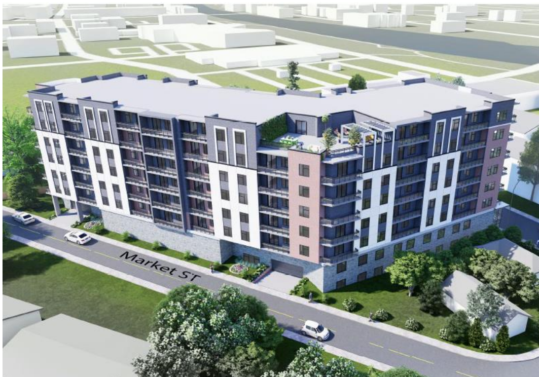
Figure 3 – Rendering of Proposed Development form Market Street

A conceptual Site Plan has been included as Appendix A to this Report.