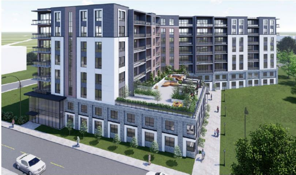
Figure 2 – Rendering of Proposed Development from Ainslie Street North