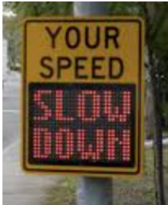
Radar Message Board