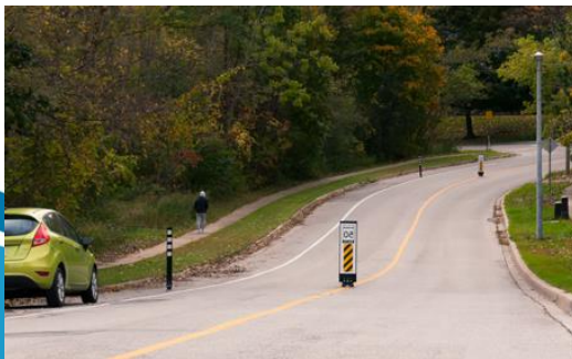
Seasonal Traffic Calming