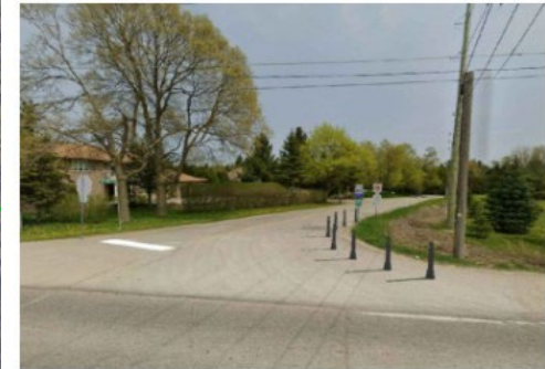
① DICKIE SETTLEMENT ROAD LOOKING EASTBOUND

NOTE: DETAILS SHOWN ON THIS DRAWING ARE BASED ON DESKTOP OBSERVATIONS ONLY.