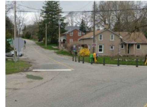
⑧ BLAIR ROAD LOOKING WESTBOUND