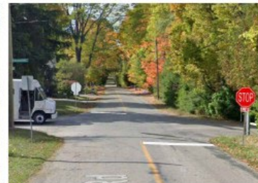
5 ALL-WAY STOP LOOKING WESTBOUND