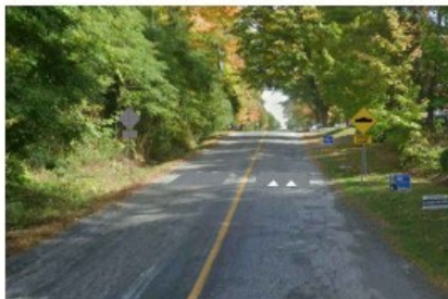
3 SPEED CUSHION - LOCATION 2 LOOKING EASTBOUND