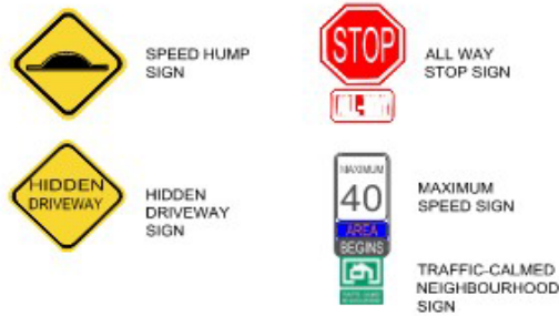
LEGEND - PROPOSED SIGNS