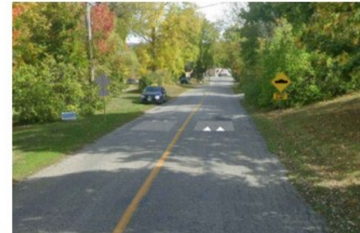
⑦ SPEED CUSHION - LOCATION 4 LOOKING EASTBOUND