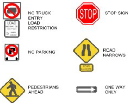
LEGEND - MAINTAINED SIGNS