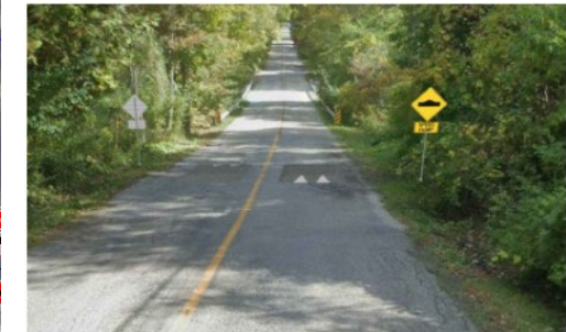
② SPEED CUSHION - LOCATION 1 LOOKING EASTBOUND