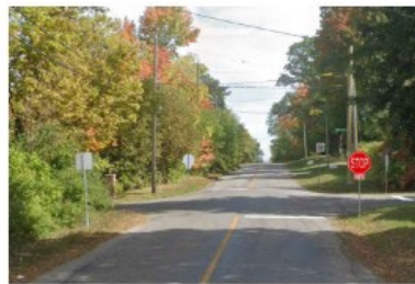
4 ALL-WAY STOP LOOKING EASTBOUND