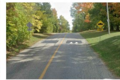
6 SPEED CUSHION - LOCATION 3 LOOKING EASTBOUND