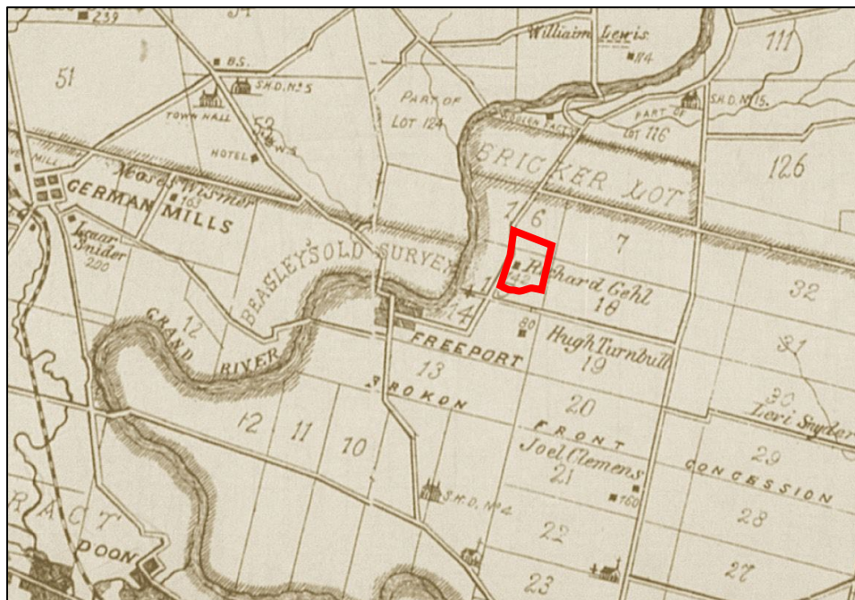
Figure 4: The subject property, outlined in red, on the 1881 Illustrated Atlas of the County of Waterloo by H. Parsell and Co. The extant farmhouse is shown on the map, under the ownership of Richard Gehl (McGill University).