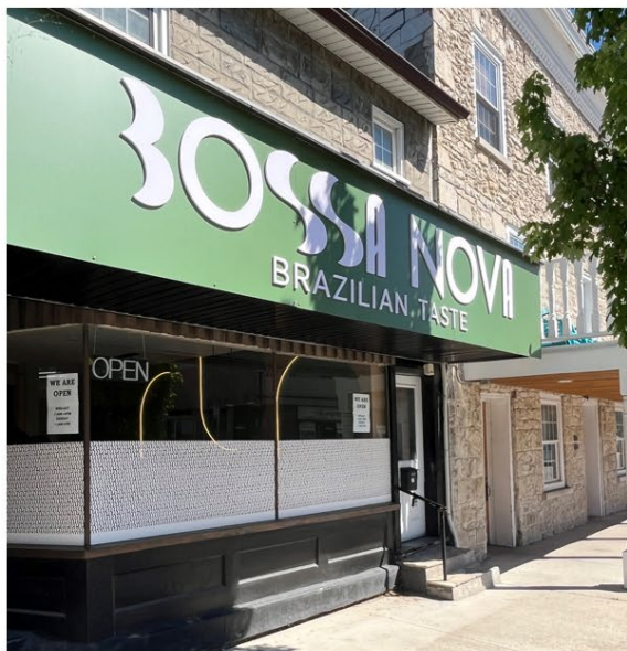
35 Queen Street East

35 Queen Street east saw the introduction of a new Traditional Brazilian Restaurant in the heart of Hespeler Village. The vibrant atmosphere has made for a wonderful experience unlike anything previously located in the Village. 39 Queen Street East received a much-needed restoration to its balcony and premises preserving its heritage.